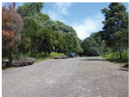
Loop exit and parking