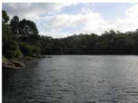
Looking left, up river