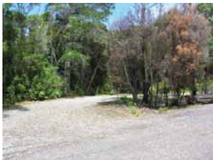
Loop above ramp

Some more photos of the Catamaran Campground: