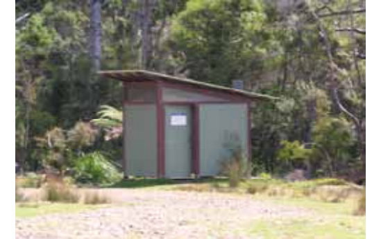
Clearly you're not at a 5-star resort, not when the pit toilet is all there is to photograph.

The site facilities are basic. Apart from the boat ramp and jetty, turn-around loop and parking, facilities comprise a single pit toilet (illustrated). You really have to bring EVERYTHING, except salt water. Fires are permitted most days, but don't expect the trip leader to bring enough wood for everyone. However, it's a lovely natural site, with free camping and is usually very quiet.