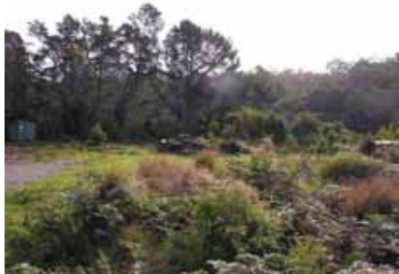
Between jetty and toilet