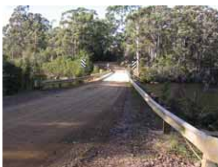
Catamaran River Bridge (Nearly there)