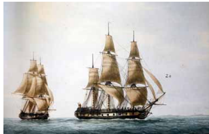
The French Expedition vessels Recherche & La Esperance

In short, it's an open weekend, at the Catamaran campground and boat ramp for the weekend of 3-4 March 2012. Come earlier if you like, stay longer; the only official function is a 5:00PM BYO barbecue, March 3 rd .