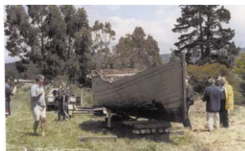
Terra Linna at Margate

The Terra Linna Sub Committee will further investigate this opportunity and report to the next General Meeting on the 18th of October.