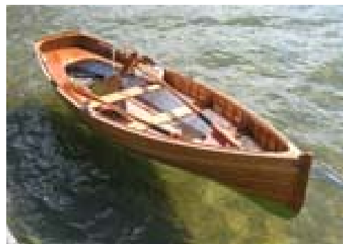
Andy’s boat at Iain’s jetty whilst we have lunch