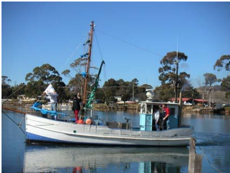
“Anna K” sets out for our rowing day at “One Tree Point”.