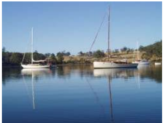
Boats on the Duckpond