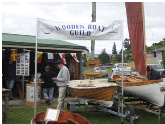
The President contemplates at our site

What a great success the Guild’s presence at the Huon Show was. Much of the success can be attributed to sharing space with the “Living Boat Trust” with a very worthwhile display of wooden boats from both organizations.