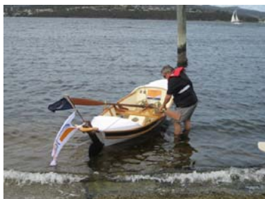
Re-launch of 'Eltin Ronan' for the 2007 AWBF.

General Meetings are on the 3 rd Monday of each month, inc. public holidays, but not in the month of January.