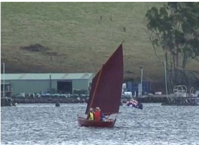
Liz and Brian with Picolo under full sail.