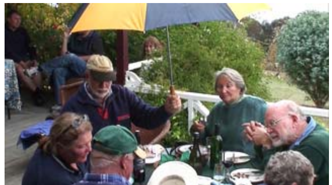
Robin decided to keep the kite up for lunch.

Well I had to mention the weather eventually of course! Yes it showered and it occasionally got a bit windy but it was also sunny and calm at times. Far better than last time we were at Bullock Pt. when it rained a lot and was quite cold.