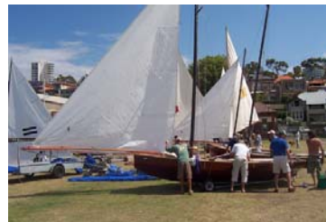
Just about ready