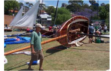
Preparing the Skiff