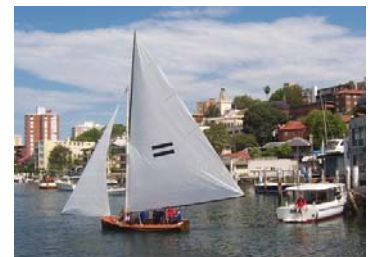
On the water! Where's the breeze?

Lets get back to earth. Next week-end we've got the double with the Huon Show on Saturday 17 th and over on the west coast at Strahan we've got A Celebration of the Piners Punt on Saturday 17 th and Sunday 18 th . It's going to be a busy weekend followed by a General meeting at 7.30 on Monday evening 19 th .