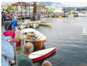
Seafarer's Festival water view