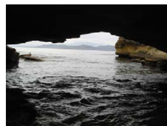
Little Spec's Sea Arch

Little Spec's sandy beach near the sea arch provided the perfect setting for a yarn, some sustenance and a bit of shell hunting. The swell made it interesting and we had to keep an eye on the beached boats. Noel and Noelene drifted contentedly just off