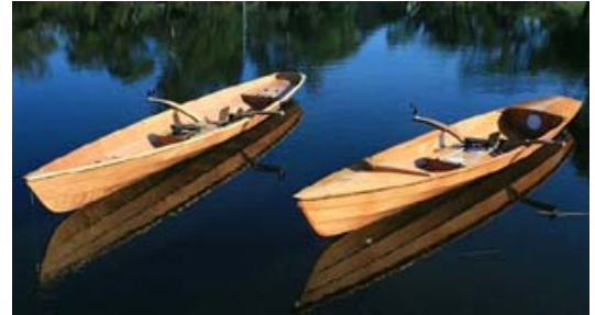
Two Derwent Skiffs side by side