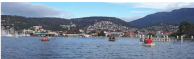
Nice panorama