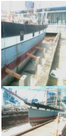
"Polly Woodside" on the Yarra Melbourne flying the National Heritage Flag. Perhaps NH funding is available for Maritime heritage vessels?