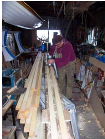
Huon rib preparation underway!

That aside the shape she is taking is something all Guild members can be proud of. If this challenge and action had not been taken she would have been another important piece of Tasmania's Maritime heritage lost forever.