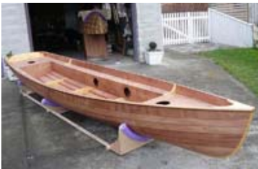
Another Derwent Skiff in the making!