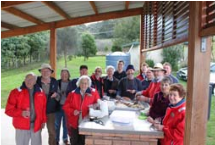
WBGT members gather for lunch at the Tinderbox beach shelter