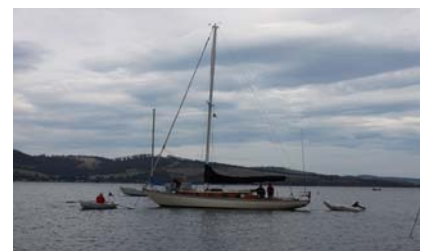
Med, Trip Leader greeting boats on arrival!