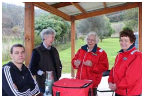
A happy chat before lunch