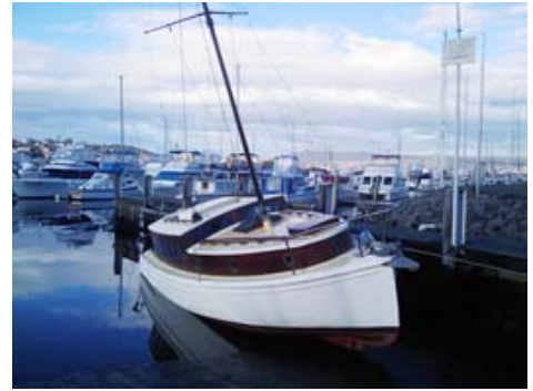
Seaspray , tired and forlorn as the new day dawns!

up the Derwent we encountered a strong NE breeze that did not take too long to bring up a very sharp and short chop with 2—3 ft white crested waves that were bouncing us around everywhere. Well some time later and back at the MYCT we had sprung a leak due to some caulking being displaced on the forward starboard side. A week on the slip and 5 sister rib replacements and refixing and re-caulking of the planks in that area and she is back in the water safe and sound with a whole new bilge pump system. Many thanks to the crew of Dallas and Graeme Hunt for their efforts and also members of the MYCT to assist, once berthed, with additional pumps and support.