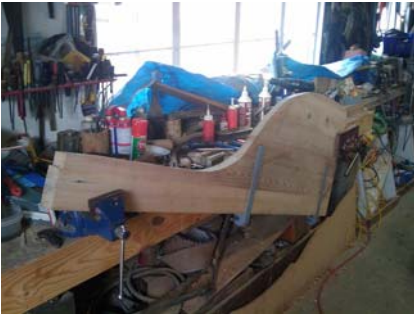
Rudder constructed with the bronze castings patterns fitted in preparation for the real thing.

Things are moving along. The rudder and Centre board have been completed ready for hardware.