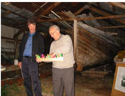
A model under construction 2004

Challenges: I'd like to see who brings the oldest model, and who brings the smallest. I don't dare ask for the largest, someone will bring a canoe or dinghy.