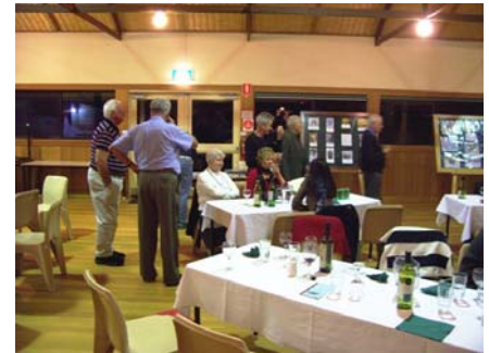
Sunday evening Dinner with the Port Sorell Historical Groups display in the background.

Monday morning was again frosty and an early row had been arranged