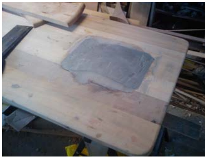
Centreboard with lead ballast in place!

The lower deck flooring is being fitted out with reclaimed Oregon from Nyrcstar. At the same time the bow sprit spar, an older reclaimed piece of timber is being reshaped and trimmed. The next trick is to be able to get the necessary curve in her to be authentic. There are a few theories yet to be tested!