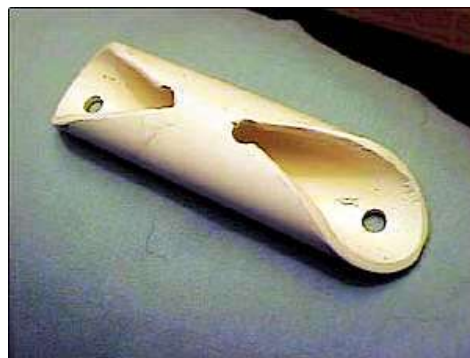
Experiment with different sized tubing and slots for the line you're using. (David Beede)

The last one is pretty experimental. It's designed to take a line or bungee cord running through it that can then be prevented from running out either way. Not often necessary, but handy for things like the loop of line used on my Venture McGregor's rudder to both hold the rudder up and down.