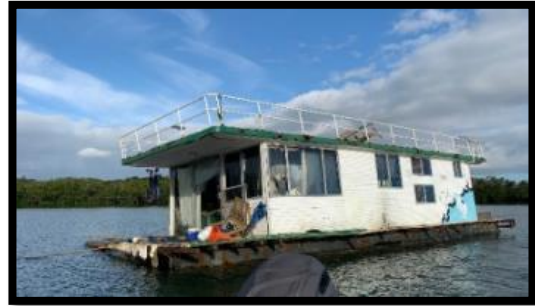
This one Noosa River

Contact Ian Mortleman 0413457656 if you can help