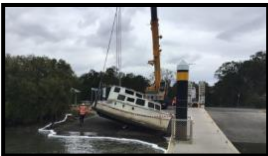
This one – Nudgee Beach